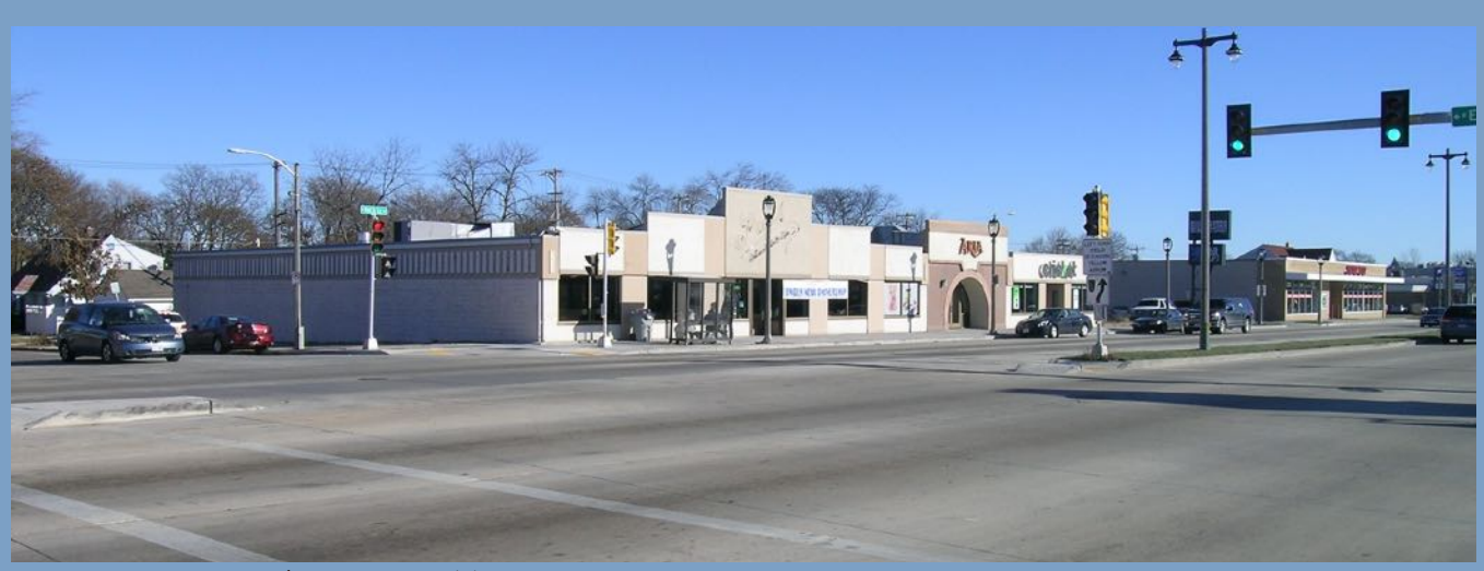
Businesses on W. Fond Du Lac Ave. (1)